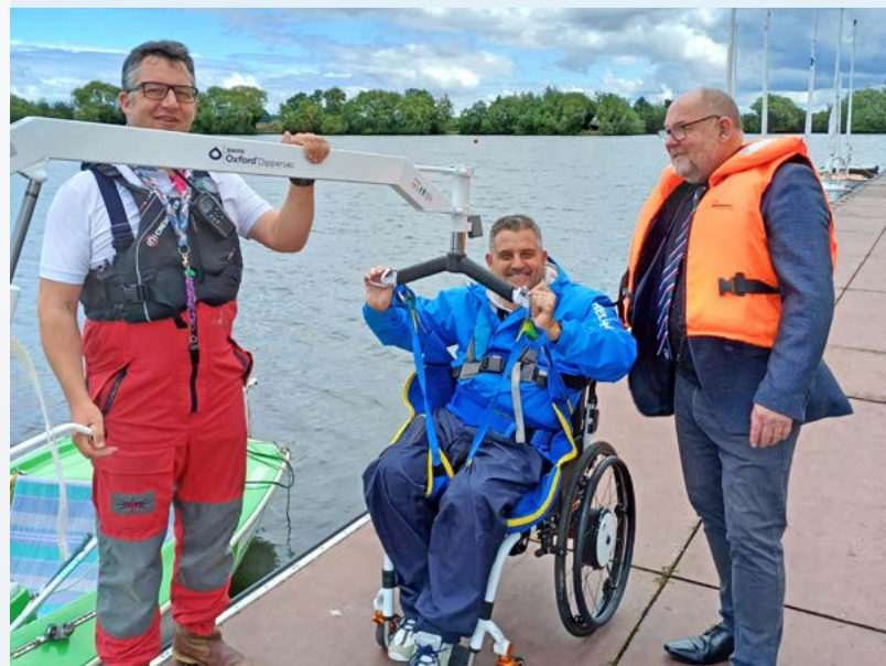
Swarkestone Sailability received £2,000 towards a hoist for disabled users.

During this process we may need to contact you to discuss the project or ask you to provide further information. We will send a confirmation email with your reference number and the meeting date at which your application will be considered.